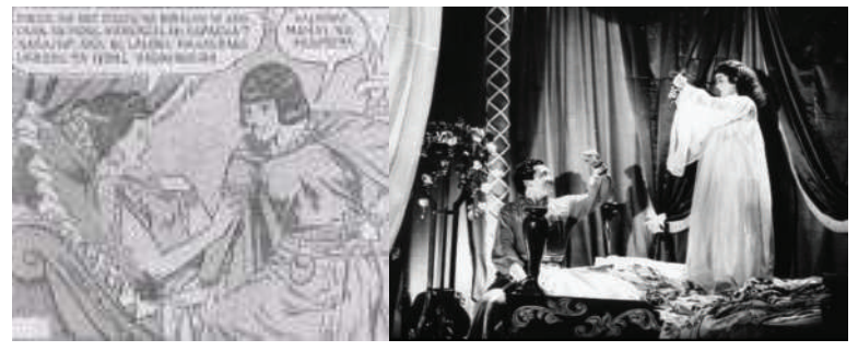
Figure 19: Zimar captures Rustum's heart.

Ironically, the girl from the rival kingdom will steal the hero's heart.