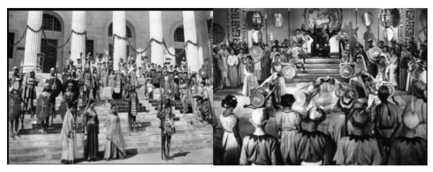
Figure 25: Triumphalism and Temporality

Assemblies and musical scenes serve as a means of deploying a denouement to the stories.