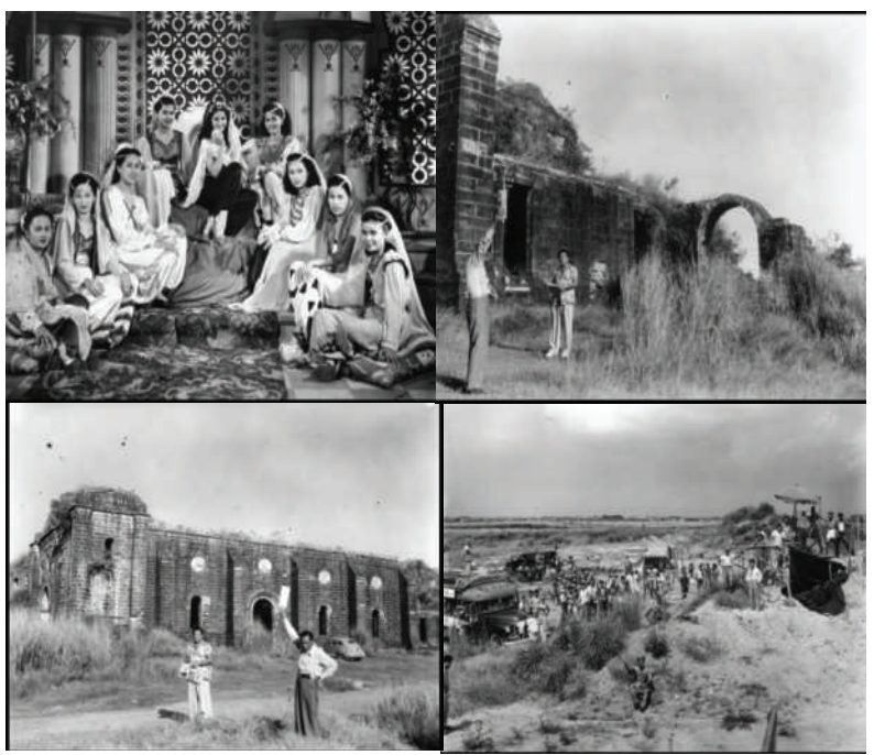
Figure 26: Breaking the Fourth Wall and the Temporal Break

Outside the universe of fictional narratives, the members of the production teams of the three films however have had a double-awareness of the whole enterprise; filmmaking being a make-believe world that is also serious work. The filmmaking process is inventive but it is also palpably real in the sense that production work will one day come to an end.