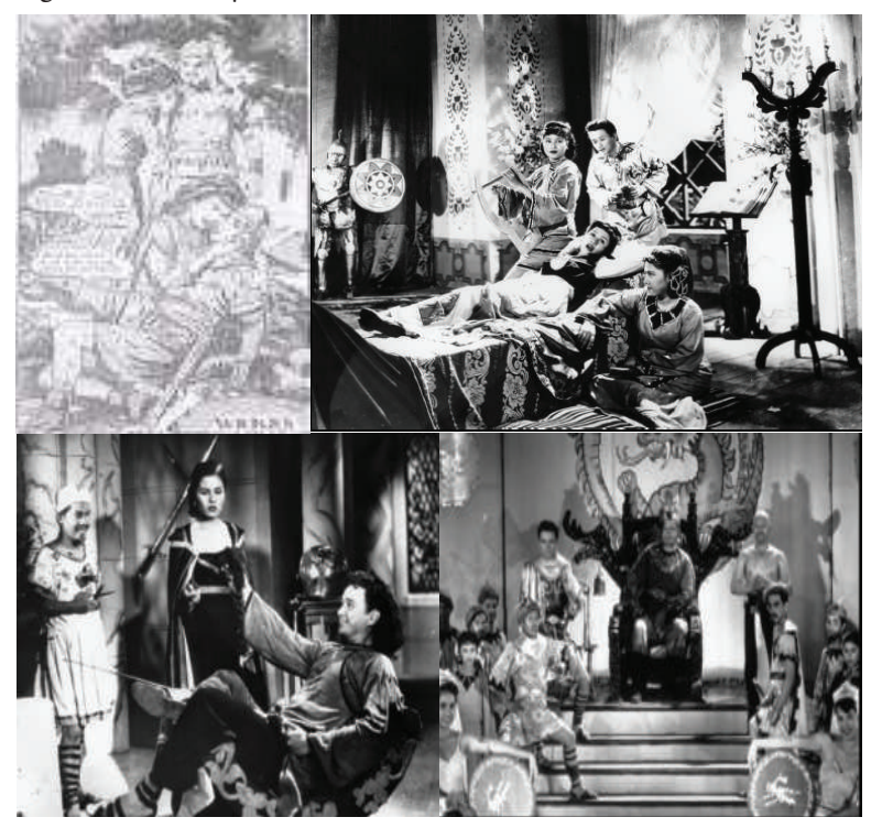
Figure 21: Identity Lost and Found

The quest for identity is an important ingredient in rendering a poignant story in a medieval film.