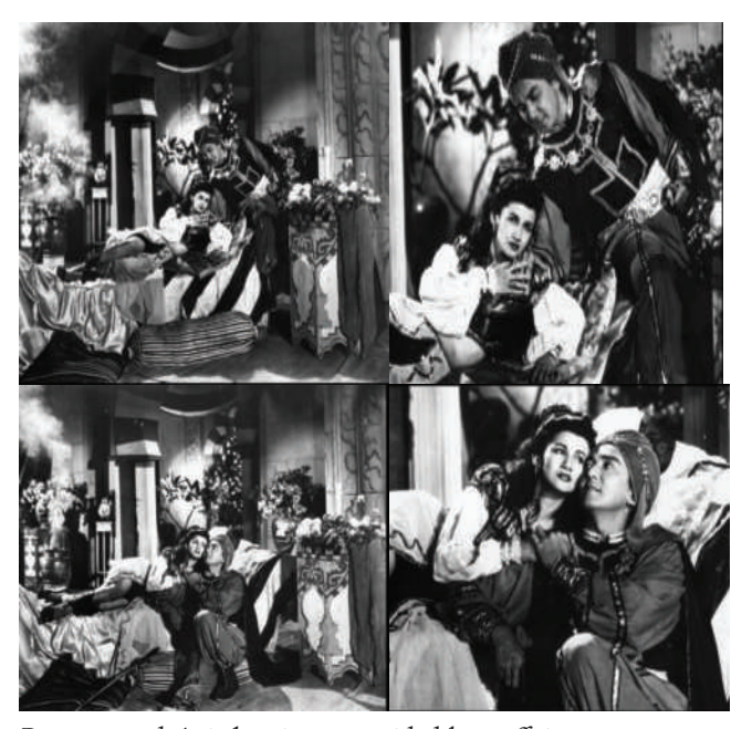
Rustum and Aristhea in a one-sided love affair.