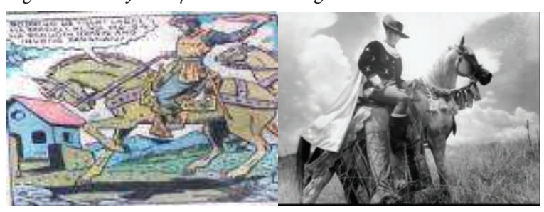
Heroes like Rodrigo de Villa embark to find their true identity.