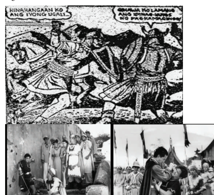
Figure 14: Final confrontation.

To highlight individuals in momentous occasions, there is the single combat. For example, Sohrab goes on a quest to find his father. Unfortunately though, through the deployment of the mistaken identity motif, father and son fight and one of them gets killed.