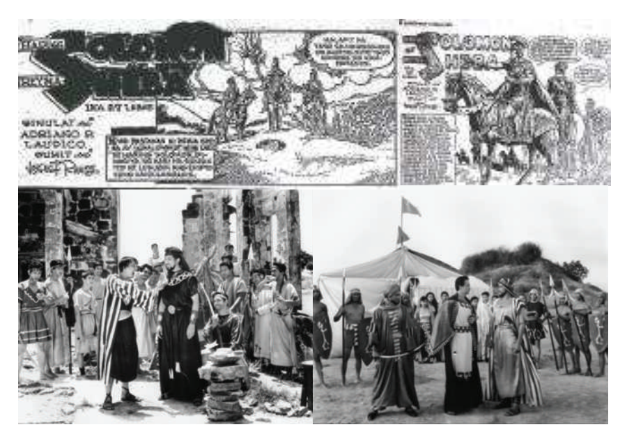
Figure 15: Impending wars as ultimate momentous occasions.

Heroes prepare for wars to fulfill their duty as nobility or as loyal servant to their monarch.