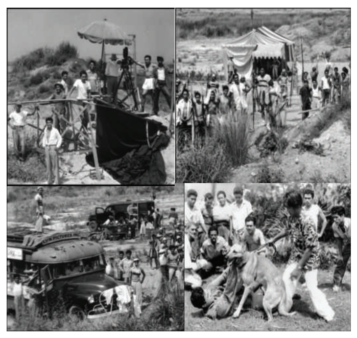
Studio photos document the double-awareness between the fictional and the real; the staged and the documentary; the temporal and the linear.

Outside the fictional narratives, the political economy of cinema allows for the dream of the Middle Ages to perpetuate. Movie magazines promote the movies and the persona of the actors in a ploy to make the romance of the story get intertwined with the real. The Middle Ages of curiosity, of nostalgia, and of transition re-emerge in the consciousness of the adoring public as shown in the following movie write-ups and promotional materials.