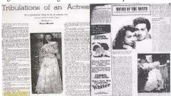
Figure 27: Promoting the "medieval" film adaptation

Outside the fictional narratives, the political economy of cinema allows for the dream of the Middle Ages to perpetuate. Movie magazines promote the movies and the persona of the actors in a ploy to make the romance of the story get intertwined with the real. The Middle Ages of curiosity, of nostalgia, and of transition re-emerge in the consciousness of the adoring public as shown in the following movie write-ups and promotional materials.