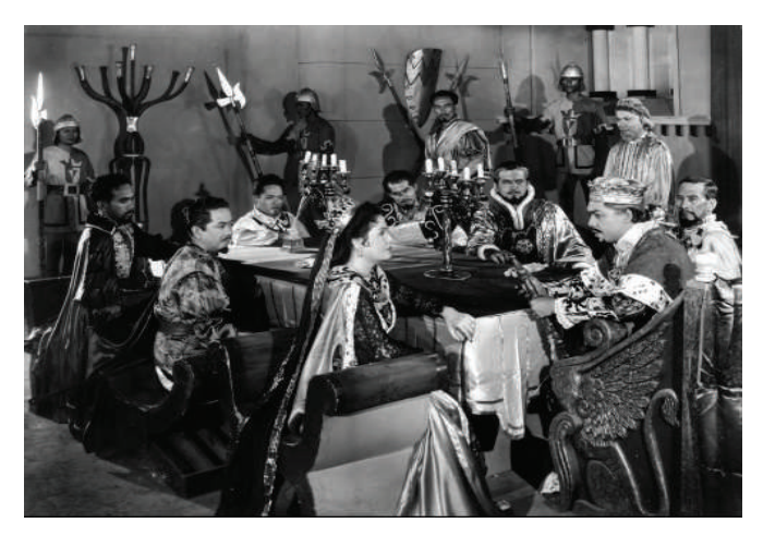
Depiction of social class as part of spatial temporality.

Similar to epics and romances, the medieval film also deploys the motif of the eternal triangle. In Sohrab at Rustum , the triangle is played out by Rustum, Aristhea and Zimar.