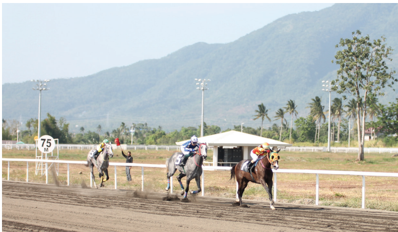
Horses racing down the stretch in one of the races of the MARHO Founders' Cup, an event I managed. The festival was held at Metroturf Racecourse in Malvar, Batangas, March 28, 2015.