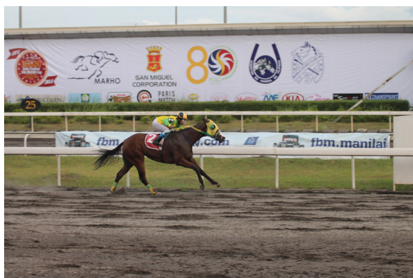
Nemesis approaches the finish line in one of the races at the MARHO Ruby Festival, held Nov. 30, 2014 at Manila Jockey Club in Carmona, Cavite. I was the event manager and very proud of our beautiful event banner in the background.

Even among kareristas , winning a wager is ascribed to suwerte even if everyone is aware that it was galing sa diskarte (strategic ability) that led to the win; the fact is known, but it is considered appropriate behavior to say it was chamba lang , in a way also consoling others for their loss by implying that they too might win next time if they are as lucky, in this manner ensuring that relationships are not ruffled by behavior that might be misconstrued as unsportsmanlike or ungentlemanly.